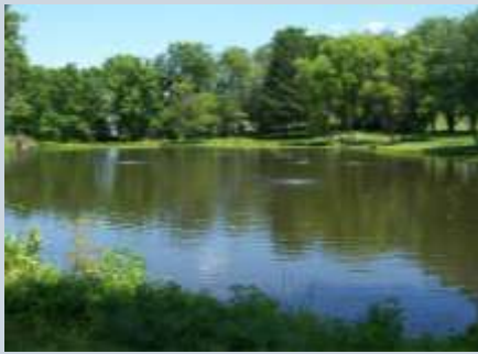
Clean Flo Aeration Bubblers at work.