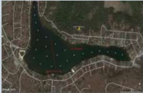
Clean Flo Diffuser Layout at bottom of Lake.

Over the past three years LHG and LHWPG have been working on plans to increase the lake depth and water quality. This has been necessary due to many years of home construction, storm water runoff and organic muck build up. Many options were analyzed but found to be very expensive and with limited funds and lack of grant money available to a private lake, we found a cost effective alternative.